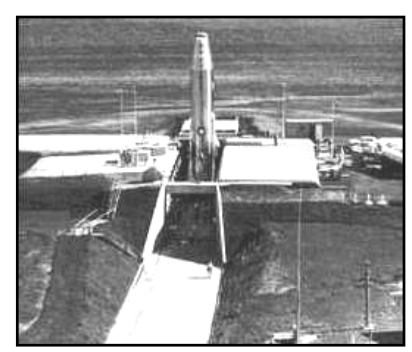
Atlas E missile complex.

Each Atlas E missile site contained two underground structures: the missile launch and service building, and the launch operations building. The launch building consists of a large underground storage area that stored one Atlas missile horizontally. The roof would be retracted and the missile would be elevated into a vertical position for launch. The operations building contained crew quarters, launch control facilities, and diesel power generators. A tunnel connected the buildings. Complexes covered between 20 to 30 acres.